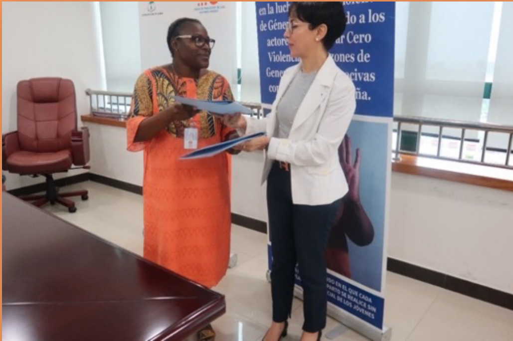
SOS Children's Villages and the UNFPA sign collaboration agreement in Equatorial Guinea