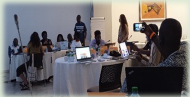
Training sessions and discussions during the Retreat