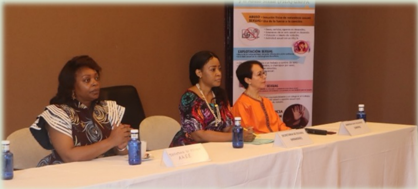
UNFPA Equatorial Guinea participated in the West and Central Africa Regional Communications Retreat