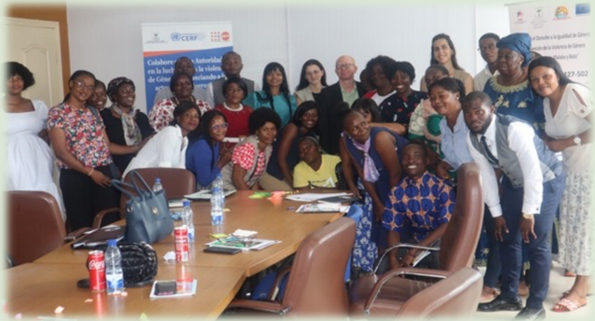
Training of Trainers organized at the Provincial level in prenatal control, family planning and Comprehensive Sexual Education for health professionals and teachers.