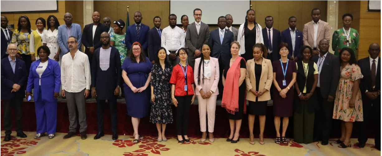
Photo credit / UNFPA-EQG Flora/Family Photo Formulation Workshop 8th Country Program-Malabo

Malabo 14-15 February 2023. The Seventh Country Program Document CPD7 between the Government of Equatorial Guinea and UNFPA, which covers the period 2019-2023, ends in December 2023 and UNFPA launched the elaboration of the 8 th CPD 2024-2028. Against this backdrop, key ministerial departments representatives, donors, Civil Society Organizations and Sister UN agencies were invited to a workshop from 14 to 15 February at the Anda China Hotel in Malabo to initiate national consultations and conduct the periodization exercise for the formulating of the eighth Country Program Document (CPD-8).