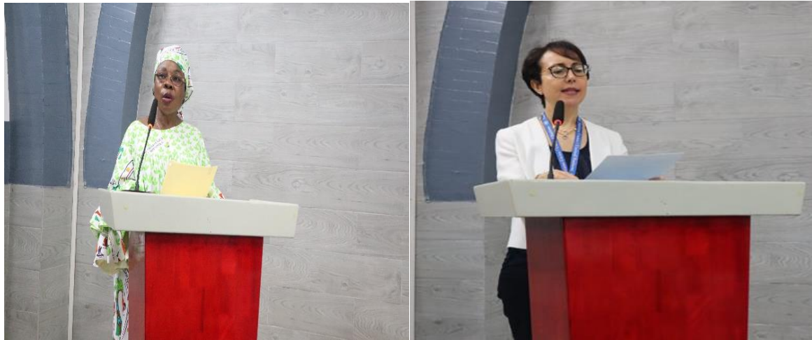
Speech by Her Excellency the Minister of Equality and the Representative of the National University of Equatorial Guinea.

Malabo, 1-10 March 2023. The 2023 theme of International Women's Day, March 8 is "For an Inclusive Digital World: Innovation and Technology for Gender Equality" , in line with the priority theme of the 67 th session of the Commission on the Status of Women "Innovation and technological change, and education in the digital age to achieve gender equality and the empowerment of all women and girls" .