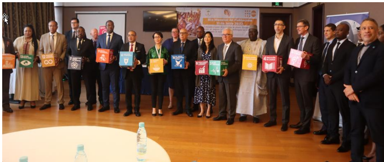
Family photo at the launch event for World Population Day activities

Malabo, 11,12 July 2023. The United Nations Population Fund celebrates 11 July, World Population Day 2023, with the theme " Unleashing the power of gender equality: Raising the voices of women and girls to unlock the infinite possibilities of our world ". UNFPA has been bringing its data, experience and stories to support the girl child since the age of 10 in a world of 8 billion through a variety of means. World Population Day 2023 gives us another opportunity to do so in force, as part of our ongoing narrative of rights and choices to create a world of infinite possibilities.