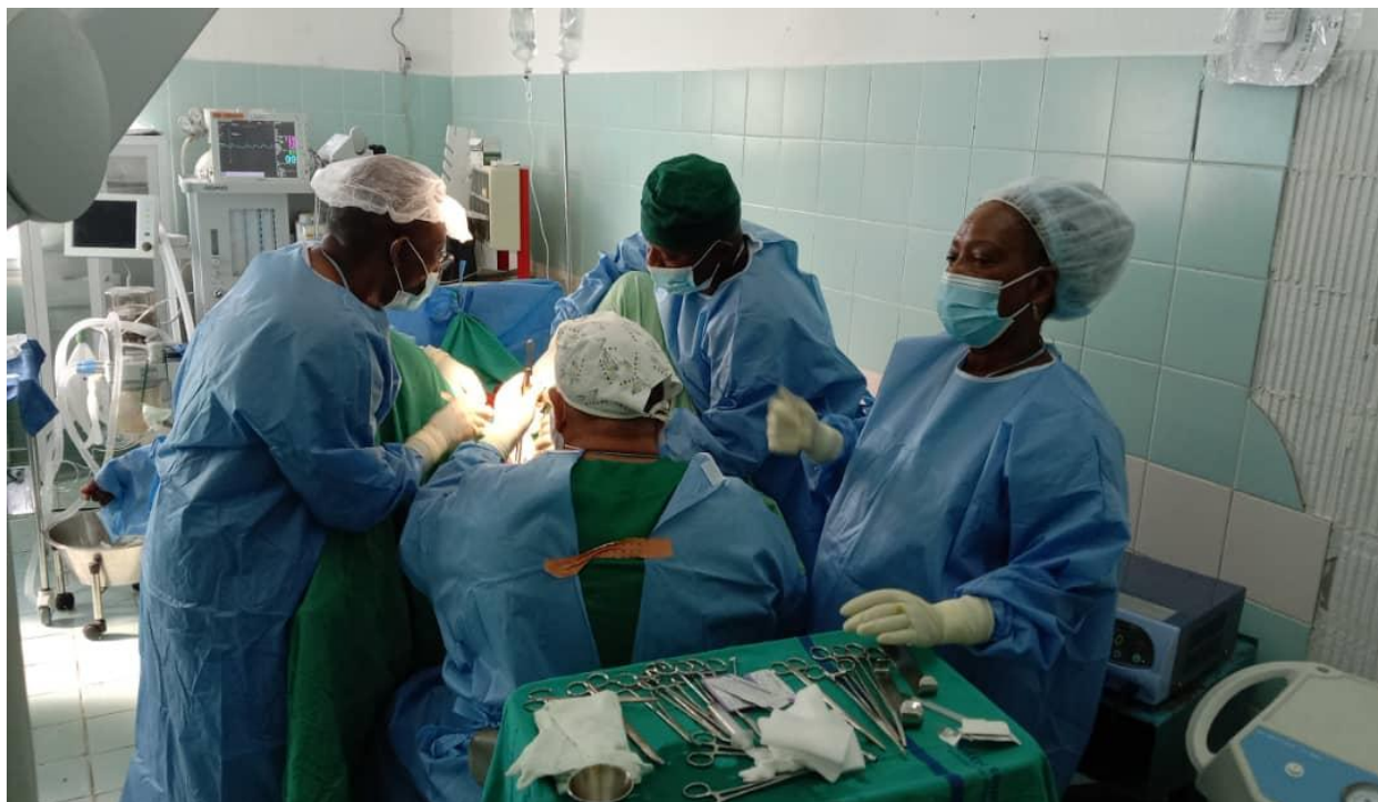
During surgery on one of the obstetric fistula patients at Bata hospital

Bata, 26,27, 28 July 2023. UNFPA provides strategic vision, technical guidance and support, as well as medical supplies, trainings and funds for fistula prevention and treatment, and for fistula-related social reintegration and psychosocial support to survivors. UNFPA also strengthens reproductive health services and quality emergency obstetric care to prevent obstetric fistula from occurring. The Ministry of Health and Social Welfare through the National Reproductive Health Program (PNSR) and the United Nations Population Fund (UNFPA) launched the 4 th Campaign to end Obstetric Fistula in Equatorial Guinea on July 26 th , 2023. Surgeries were performed at the Bata Regional Hospital by a national medical-surgical team trained to repair obstetric fistula.