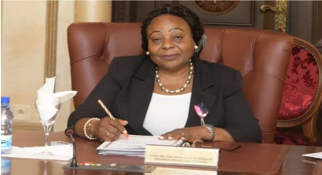
Her Excellency Ms. Manuela ROCA BOTEY, Prime Minister of the Republic of Equatorial Guinea-2023

Malabo February 01, 2023. His Excellency the President of Equatorial Guinea signed yesterday Tuesday January 31 st , the decree number 43/2023 on the nomination of the first woman Prime Minister, in charge of the Administrative Coordination, Her Excellency Mrs Manuela ROCA BOTEY, is thus the first Equatoguinean woman to occupy this post in the history of the country.