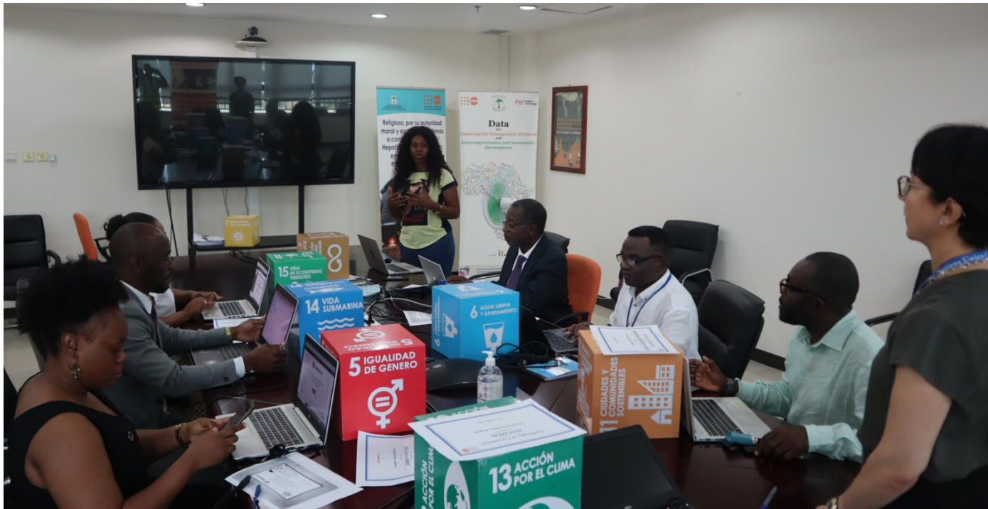
Learning Afternoon Green the Blue- Malabo

Malabo, November 1 <sup>st</sup>, 2022. The world is in a climate emergency – "a code red for humanity" according to the UN Secretary-General. The concentration of greenhouse gas (GHG) emissions in the atmosphere is wreaking havoc across the world and threatening lives, economies, health and food. The world is far from securing a global temperature rise to below 2°C as promised in the Paris Agreement. With a baseline in 1990, some countries are emitting more, some the same and others are emitting less. As we are caught up in the triple planetary crisis: the climate change, pollution and biodiversity loss, each of these issues has its own causes and effects and each issue needs to be resolved if we are to have a viable future on this planet.