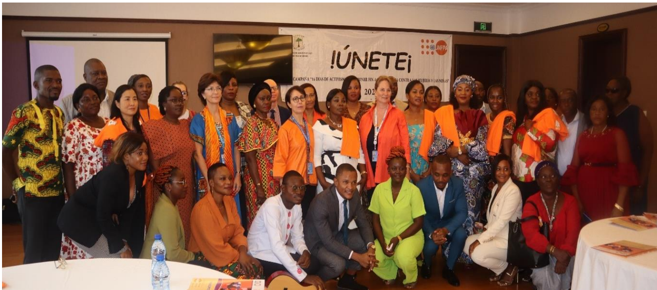
Photo credit: Miguel Ángel Suakin: Family photo of the official ceremony - Hotel Colinas-Malabo.

Malabo, 09 December 2022. On the occasion of the celebration of the "16 Days of Activism to end Violence against women and girls" that started from November 25 to December 10; the United Nations Population Fund, UNFPA Equatorial Guinea, together with the Ministry of Social Affairs and Gender Equality and sister UN Agencies in Equatorial Guinea organized a series of activities, under the 2022 theme UNITE! Activism to end violence against women and girls. This campaign contributes each year to fight violence against women and girls through multiform interventions including the engagement of men and boys as actors of change.