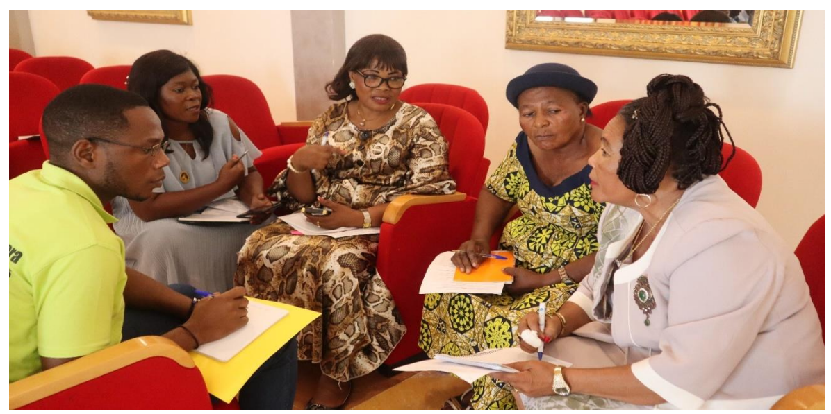
Photo credit: UNFPA-EQG/Flora: Discussions and group work among NGOs during the workshop in the city of Bata.

Bata, September 15-17, 2022. Within the framework of the implementation of the 7<sup>th</sup> Program of Assistance of the United Nations Population Fund to the Government of Equatorial Guinea covering the period 2019-2023, this activity contributes to achieve the UNFPA Transformative Goal: Zero gender violence, including harmful practices that mainly affect women and girls in the world in general and in Equatorial Guinea in particular. In this regard, from 15 to 17, the United Nations Population Fund with the support of the Ministry of Social Affairs and Gender Equality, carried out in Bata in the Conference Room of Ngolo; the Training of CSOs for the elimination of socio-cultural and discriminatory norms, with the aim of identifying NGOs that developed advocacy platforms, with the support of UNFPA to eliminate discriminatory gender and socio-cultural norms that affect women and girls, discuss the issue and propose a training plan for capacity building.