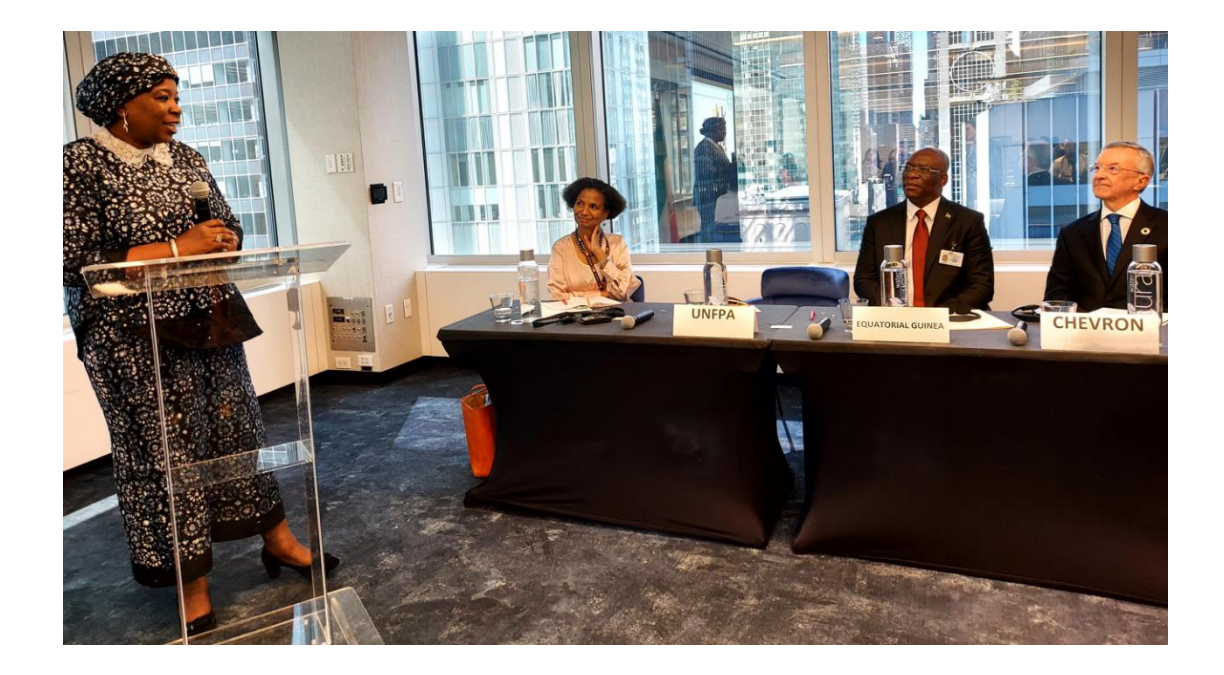
UNFPA and UNAIDS Equatorial Guinea raise awareness among adolescents and young people at the CANIGE Multilingual Educational Center in celebration of United Nations Day 2022